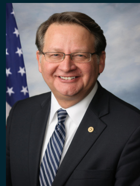
Senator Gary Peters (D - MI)