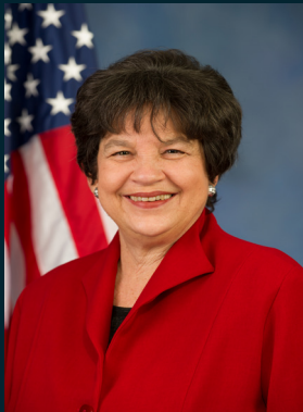
Representative Lois Frankel (D - FL)