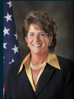
Representative Jackie Walorski (R - IN)